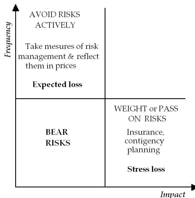
Figure 2. Matrix on Operational Risk Management as a Function of Impact potential and Frequency of the Related Events